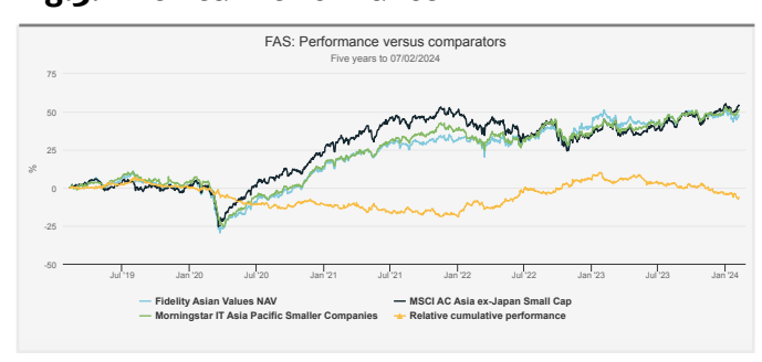
Fig.3: Five-Year Performance

We have shown the cumulative relative performance of FAS relative to the benchmark on the chart below. The yellow line climbs notably in 2022 as the value style became a tailwind, leading to cumulative outperformance of almost 20 percentage points in early 2023. Relative performance has slipped back recently due to the overweight to China in the latter half of the year, but regardless, the trust is broadly in line with both the benchmark and the peer group over five years.