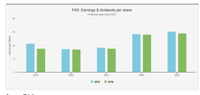
Fig.6: EPS & DPS

Despite the strong growth over the years and healthy dividend position, we believe FAS' capital growth potential is likely to be of most interest to investors. The board has reiterated the dividend is an output of the process and therefore there is no guarantee the current level will be sustained going forward. The manager believes the dividend is a demonstration of the process' success in identifying value which suggests a dividend will continue to be an element of total returns, though not the primary driver.