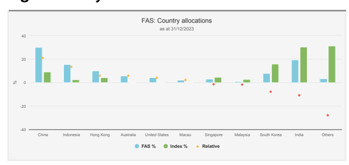
Fig.1: Country Allocations

Conversely, Nitin has only one position left in Taiwan. He highlights that aggregate profit margins, earnings and valuation multiples are at all-time highs, despite many firms having very commoditised products. Nitin doesn't believe there is any margin of safety in current valuations and therefore sees limited appeal. He believes there are a number of attractive businesses with good management teams but is remaining disciplined with valuations.